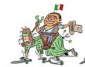
Berlusconi Taming the Italian Justice