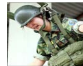
A woman cries while taking an airborne operation drill...