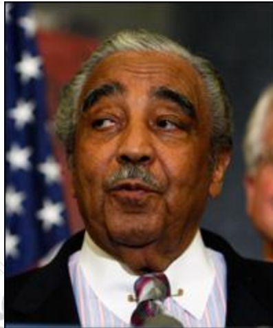
Rep. Charles B. Rangel

The two Koreas have remained technically at war because the 1950-53 Korean War ended in an armistice, not a peace treaty. The war is often forgotten in the public consciousness and hence is often referred to as the "forgotten war."