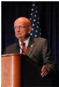
GEN Gordon R. Sullivan, USA, Ret. President & Chief Operating Officer, ASSOCIATION OF THE US ARMY (AUSA)

Shifting the burden of our nation's fiscal mess on to the backs of our military –less than one percent of our population who volunteer for decades of service in harm's way defending our way of life – is morally bankrupt. http://www.ausa.org/about/prescorner/Pages/MilitaryRetirementPay.aspx